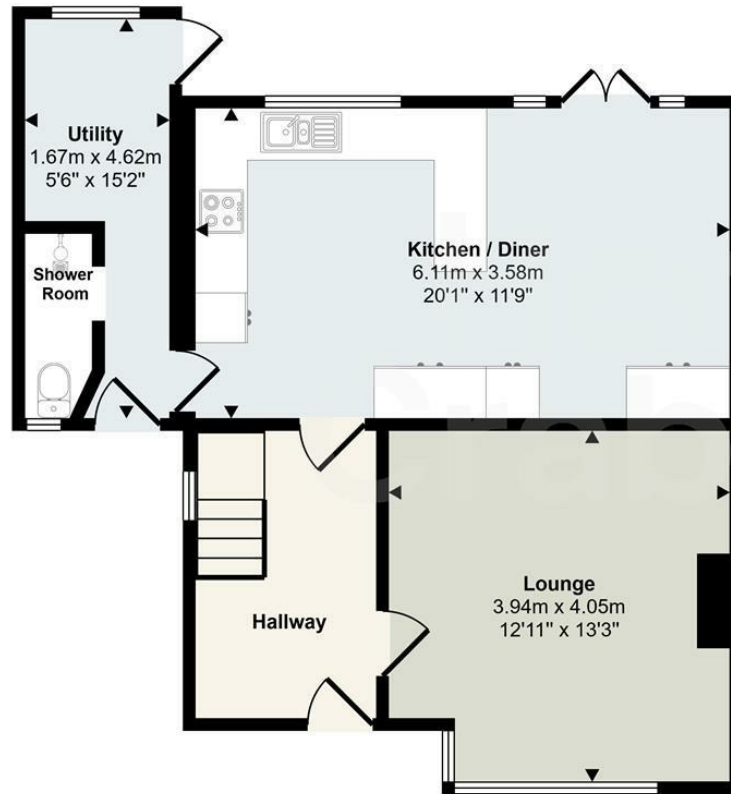
Ground Floor Approx 54 sq m / 582 sq ft

Approx Gross Internal Area 98 sq m / 1058 sq ft